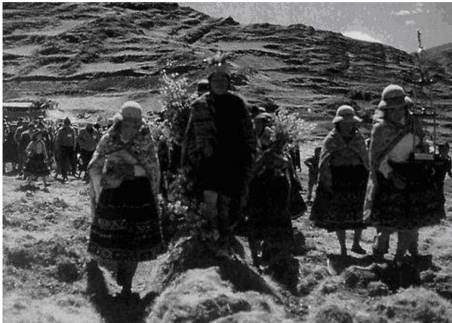
Photo 8. Last year's winning team is staging an allegorical performance around the Inca, dedicating their trophy to the present contestants

Despite the success of the unu kamachiq , the new irrigation methods are only very slowly adopted by the communities. It is thought that perhaps the existence of the ayne groups offers an explanation for this. An ayne group consists of a number of farmers, who combine their workforce to prepare one another's land. The ayne , therefore, is a neighbor-help group. If a farmer who participated in the unu kamachiq wishes to introduce new irrigation techniques, he must first convince the members of his ayne to accept them. This is no easy undertaking. The unu kamachiq is therefore now followed up by identifying and including the whole ayne . The contests are now taking place on the lands of the whole ayne , and last a whole season, from seedbed preparation to harvest. The ayne leader will be a person who participated previously in the unu kamachiq . It is hoped that, in this way, the new irrigation techniques will be more readily accepted and adopted.