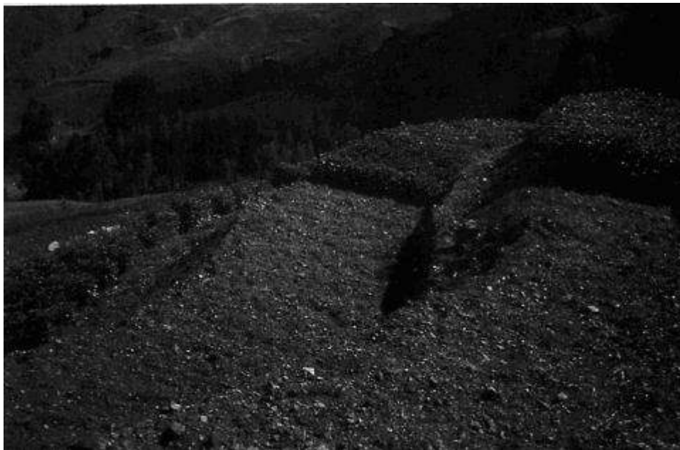
Photo 11. Short terraces with stonewall protection made in a steep gully to halt erosion and to produce seed potatoes.

The short terraces are made across erosion gullies, and have stonewall-protection. Their main purpose is not to protect irrigation canals, but rather to halt further gully formation and, at the same time, to form cultivable soils (e.g. for seed potatoes, Photo 11)