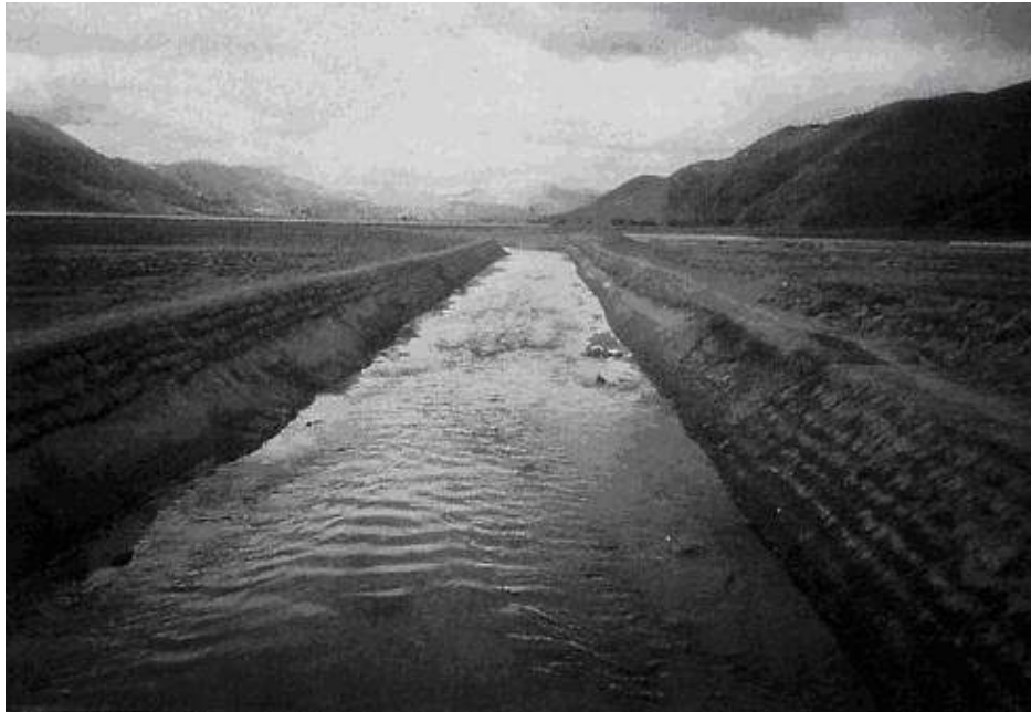
Photo 10. A brook, traversing the pampa (a former lake filled with sediments) has been bunded with sods (champas) from the surrounding natural pastures, an effective way of flood-control.

Often, the flood-control bunds are ingeniously made of champas (Photo 10), which are sods cut from the nearby natural pasture. The bunds, therefore, remain vegetated and are very stable. They have also proved their usefulness in the bank protection of irrigation canals. Even the larger bunds along major rivers have successfully been constructed of champas . Further, it appears that the borrow areas of the sods restore their vegetation quickly, and thus do not lose much of their pastoral value.