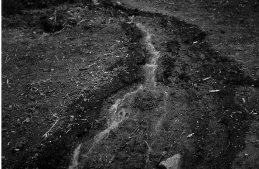
Photo 5. Example of an unattended irrigation application with a small and inefficient stream size.

The traditional practice of small irrigation flows in Cuzco stands in contrast to the large flows used in Cochabamba. The irrigation systems in Cochabamba are designed to make as much use as possible of the flash floods in the rivers and brooks. This demands large canals and a fast watering of the fields ( riego por golpe ). The unit stream sizes may go up to 50 l/sec per field and sometimes to the point that they become erosive. In general, however, erosion does not take place. On the contrary, the silt load of the water is often deposited on the land, enriching and fertilizing the soil (the lameo ).