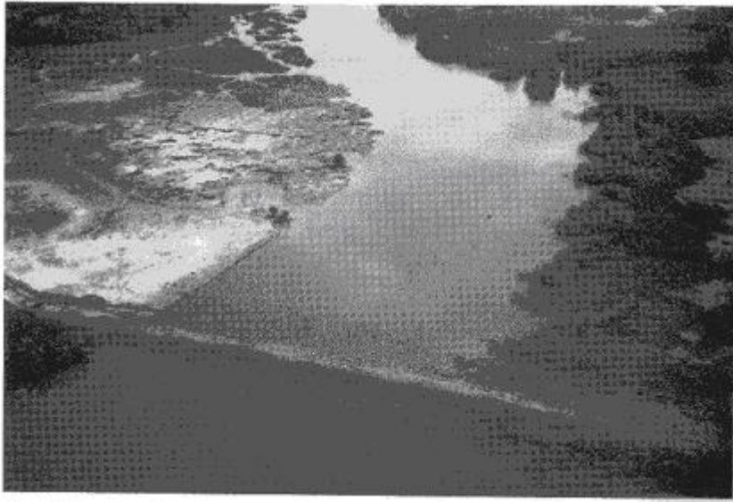
Figure 4. Dam made of laterite.

Originally, bulldozers were used to do the work, but a far more efficient of earth moving is by trucks and loaders. It is one of the major accomplishments of the Rice Polders Reclamation Project that all agencies involved in dam construction within the project have now incorporated the truck-and-loader method in their works.