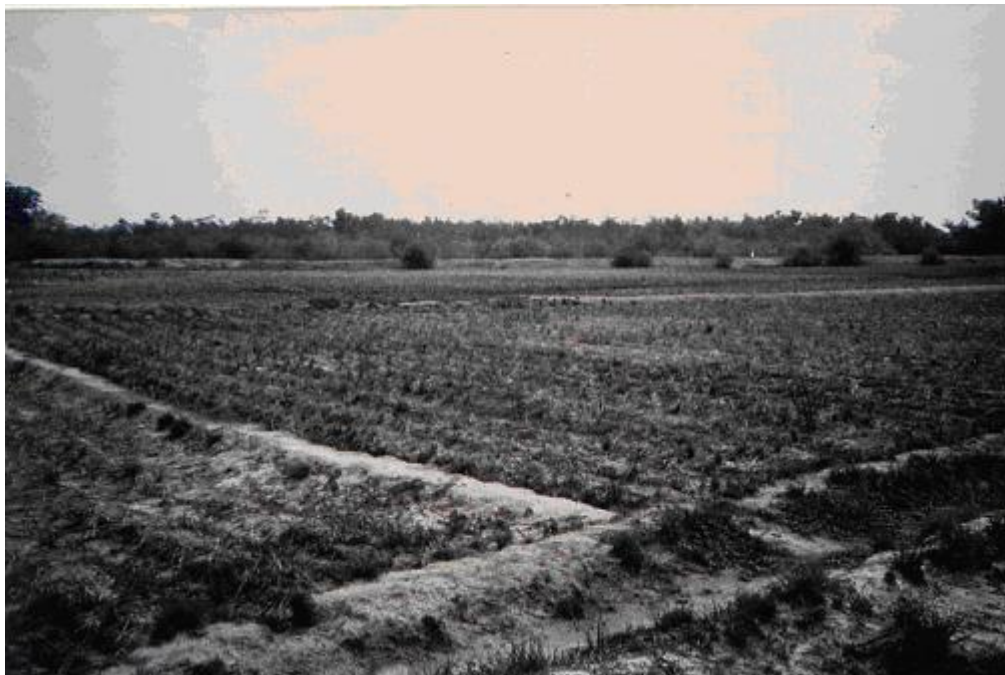
Figure 5. Rice is planted on ridges