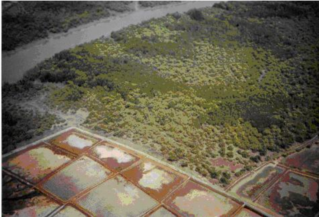
Figure 2. Empoldered land (bolanha) ready for rice cultivation