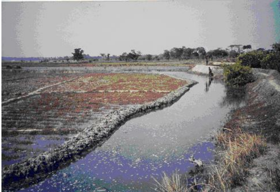
Figure 7. After harvest, sea-water is permitted to enter the bolanha for weed control and to improve the soil acidity caused by the presence of sulfuric acid. An ourique is visible at the right.

As soon as sufficient rain has fallen to make the soil workable (it has been thoroughly desiccated and hardened in the dry season) the ridges are heightened with soil from the gullies/furrows in between. The heightening is necessary because the ridges are eroded each year by the rainstorms occurring during the growing season. The rice cultivation proper begins in August, the months with the highest rainfall (at an average of roughly 20 mm/day).