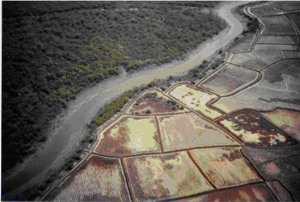
Figure 5. The parcels are separated by bunds and have irregular size and shape

bolanhas are deliberately flooded with sea water at high tide for weed control and possibly as a cure to soil acidity (Figure 7).